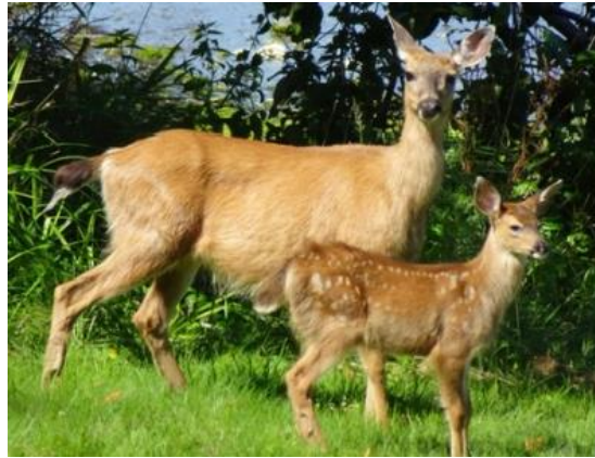
Doe and fawn in the back yard

It just means that you'll likely see nibbled plant tips everywhere, and we ask that you keep the gates closed so the upper garden is safe 😊