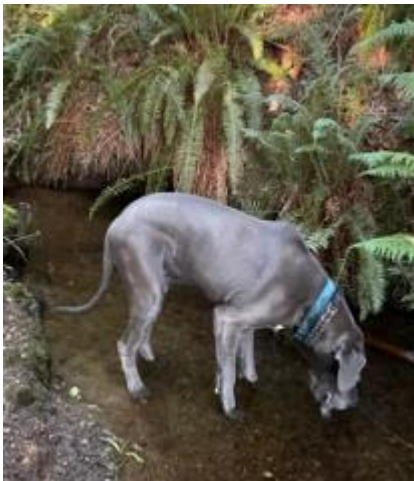
Be it the beach, the spit, or the woods, your dog will love it here!